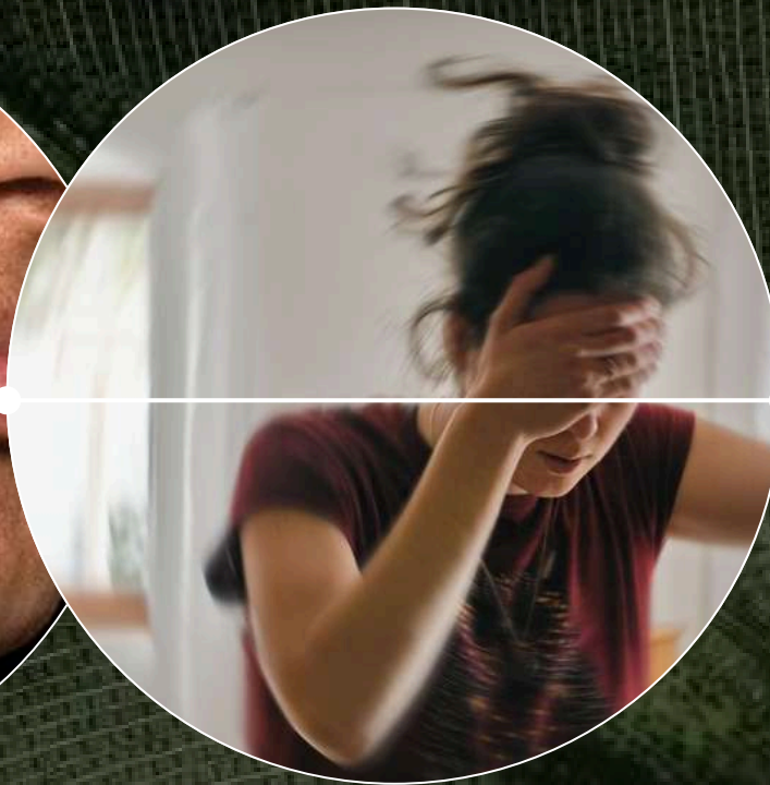
Fatigue right before the event