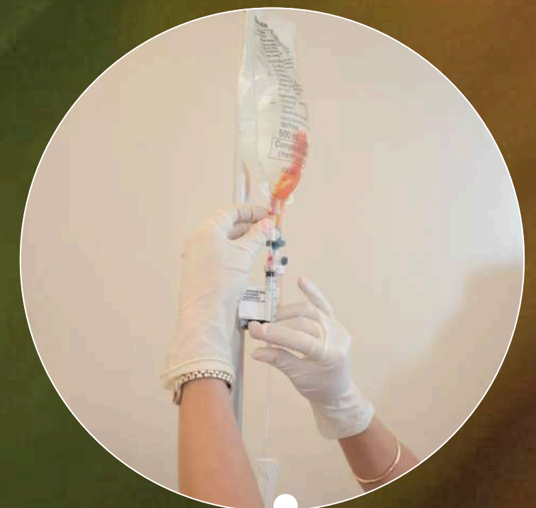
Zen Brightening Drip

Your skin's final polish before the spotlight awaits at Zennara.