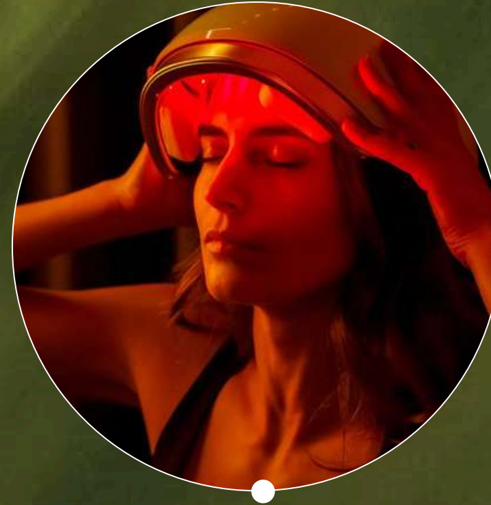
Scalp LED Therapy